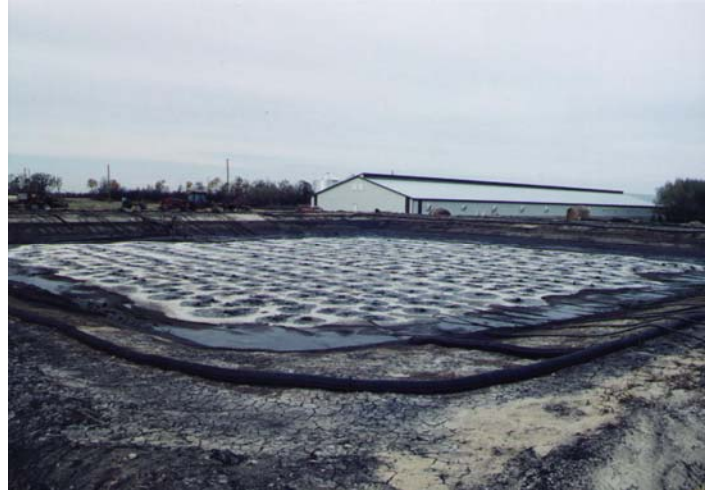
Figure 4. Air assisted agitation system in operation

To assist with the filling and emptying of the manure storage, separate concrete wet wells are often utilized. Concrete ramps normally installed for conventional pumps can be eliminated with the NAP cover and air agitation system.