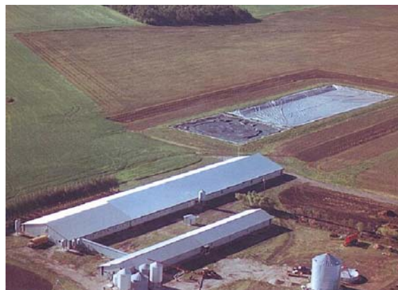
Figure 2. Installed negative air pressure cover system in a swine farrow-to-finish operation

Zhou et al. (2005) conducted field measurements to assess the impact of the NAP cover on downwind odor. Fifteen human odor sniffers were trained to use an 8-point ASTM Odour Intensity Reference Scale (ASTM 1999) to quantify the field odor intensity within a 1-km radius of two 3,000-sow farrowing facilities, one with a NAP EMSB and the other one with an open EMSB. Based on the data from Zhou et al. (2005), Gu et al. (2006) developed predictive equations for downwind odor intensity for the two facilities (fig. 2). Downwind odor intensity from the facility with the NAP EMSB was about 1.5 levels lower than that with the open EMSB at 100 m and the difference was 0.5 intensity levels at 1 km. If the intensity level 3, which describes an odor intensity of little annoyance , is used to define the odor annoyance free distance (OAFD) ( I = 3 , \text{OAFD} = D in predictive equations), the NAP cover resulted in an OAFD of 667 m, whereas the open EMSB 926 m. This implies that the NAP cover could reduce the setback distance by 28%.