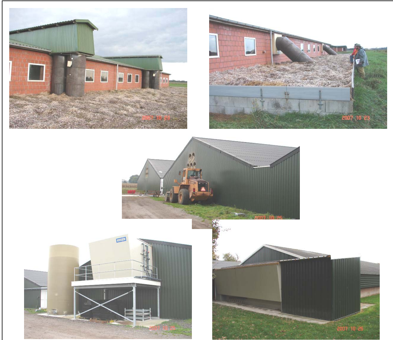
Figure 5: Treating ventilation air from AFO structures involves substantial facilities engineering and increased energy costs for even the simplest of AFOs. Top: two open air, horizontal biofilters for treating swine barn ventilation air. Center: a swine barn ventilation system being prepared for downstream mitigation. Bottom: a swine barn (left) and broiler barn (right) with ventilation air treatment systems. Summary