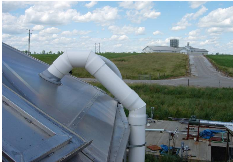
Figure 3: Treatment of headspace gases in waste storage structures involves minimum ventilation for maintaining methane concentration below explosive limits and hydrogen sulfide below dangerous limits, and downstream treatment of the exhaust with gas-phase biofiltration for odor and ammonia removal (see Figure 2). Background: the swine facility utilizes exhaust stacks for high velocity ejection of ventilation air, pull-plug gravity flow systems for manure handling, collection into an in-ground tank (concrete pad in middle-ground), and storage in two above-ground impermeable tanks for twice-annual pumping to direct injection sites for crop fertilizer.