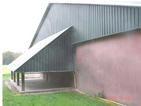
Figure 1: A simple physical barrier around exhaust ventilation fans to reduce dust emissions.

Ventilation air treatment technologies include ozonation and odorant masking, neither of which has proven to very effective. Other more promising technologies include means for dust and gaseous emissions reduction. One simple technique that is becoming better understood is use of windbreak walls downstream of exhaust ventilation fans. The walls can be a combination of physical barriers to divert exhaust air (Figure 1), vegetative buffers to physically capture dust from the exhaust air, or vertical chimneys for improved dispersion. These techniques rely primarily on physical treatment to remove dust, which in turn reduces odor and certain gas emissions; or improved physical dispersion which acts to improve downwind odor concentrations but does not treat the ventilation air.