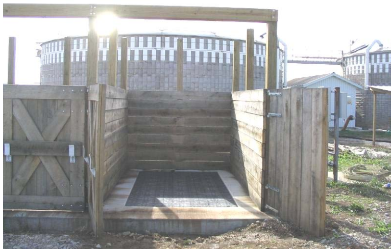
Figure 2: Gas-phase biofilter to treat headspace gases for odor and ammonia.