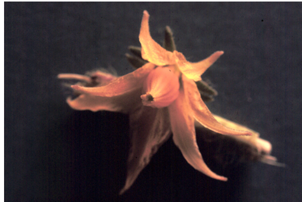
Tomato flower at anthesis – subject to high temperature flower abortion.