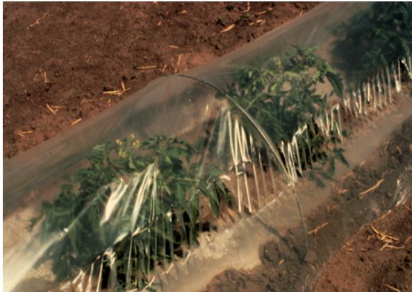
Remove or open row cover to avoid high air temperatures when first flower clusters are open.