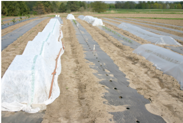
Agribon and slitted, clear-hooped row covers.