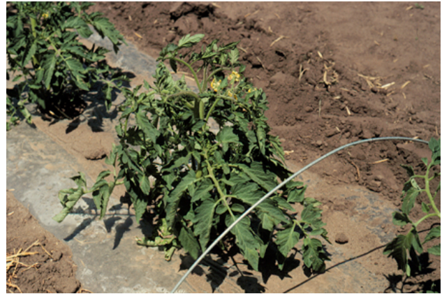
Removal of row cover about the first of June in central Iowa.